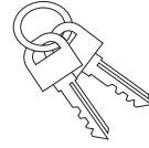
■ 2 Keys for Dispenser (inside the dispenser)