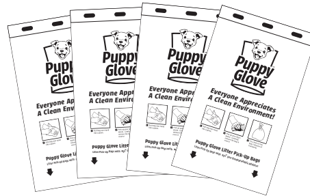
■ 4 Hanging Dog Waste Pick Up Bag Packs (100 bags per pack)