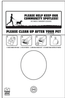
■ Aluminum Bag Dispenser